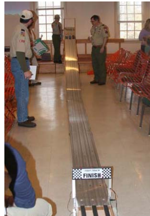
Cub Scouts Pinewood Derby

Scouting: There are a number of Boy Scout and Girl Scout troops that meet at the church. Contact the church office for more information.