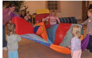
Family Game Night

We believe that the "family" is not limited to those whom we call relatives. Family is where persons are received in love and given their identity and self-worth. Persons are nurtured and guided in their growth and understanding of their spiritual and cultural heritages. They are encouraged to seek their vocation as children of God.