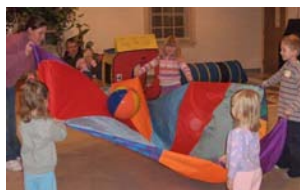
Family Game Night

We believe that the “family” is not limited to those whom we call relatives. Family is where persons are received in love and given their identity and self-worth. Persons are nurtured and guided in their growth and understanding of their spiritual and cultural heritages. They are encouraged to seek their vocation as children of God.