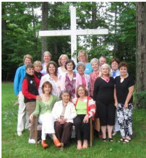
Companions in Christ Bible Study on Retreat

We welcome and encourage adults of any age single or married with or without children