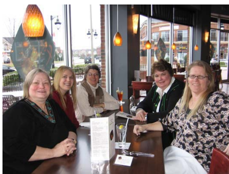
STARS Singles Sunday School

Our Church Library has books for all ages - serious books, books to make you smile, Christian fiction, inspiring books and references. Check-out is on the honor system.