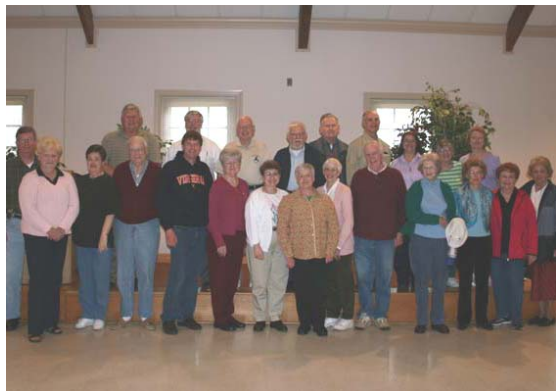
Pastor's Thursday Morning Bible Study

Need Child Care? Most of our classes will provide child care upon request.